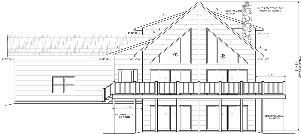
VIEW A A6